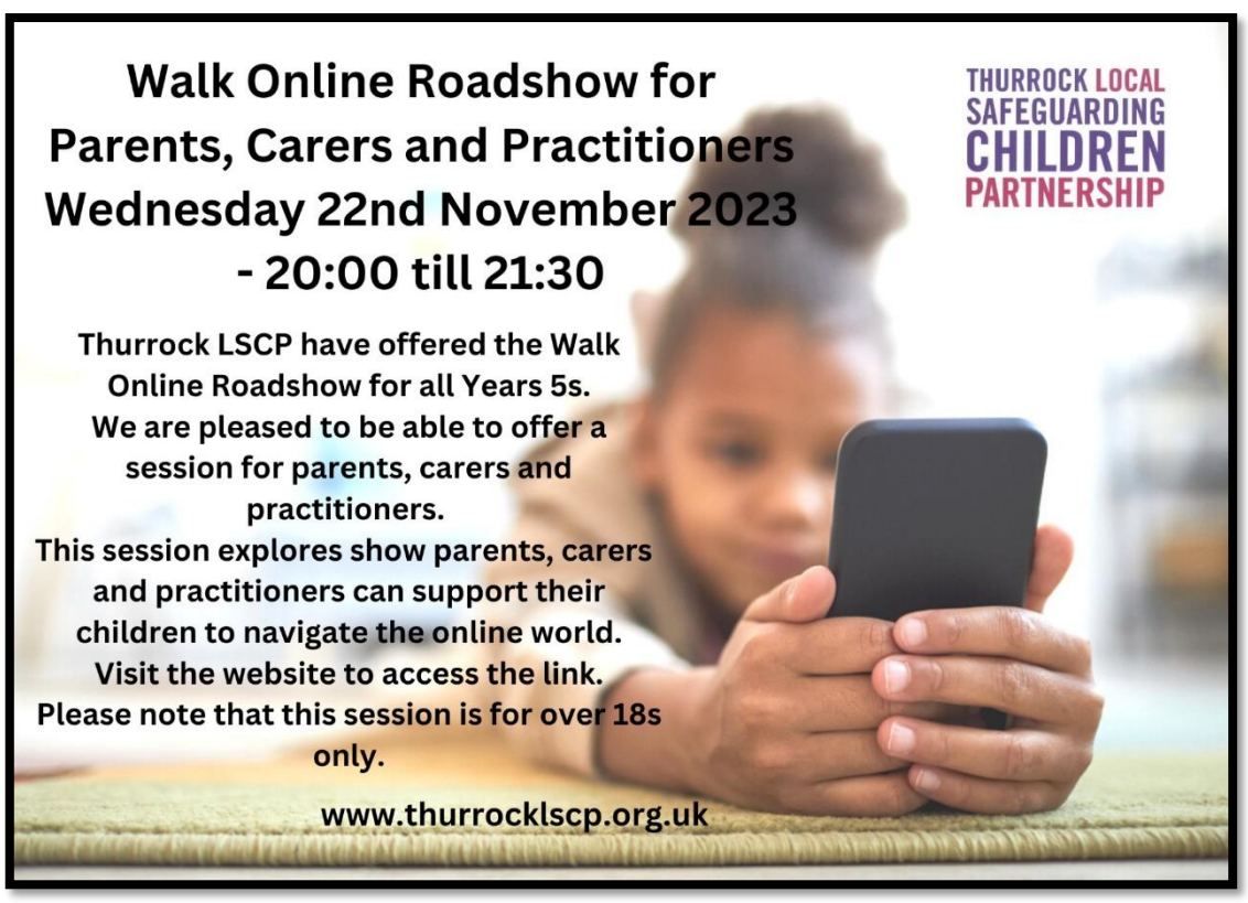
<u>Together,</u> <u>can work to ensure a safe and supportive environment for every student and family.</u>